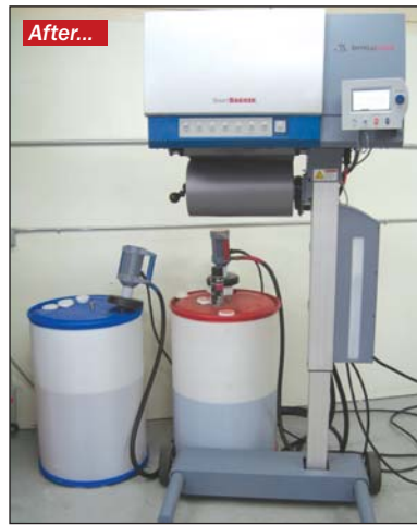
Today... Teka incorporates Intellipack system which reduces packaging costs as well as superior protection of shipped products.