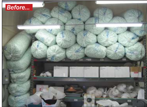
Before...Peanuts, peanuts, peanuts! Teka's former time consuming and labor intensive packaging system.

We are very excited to be using this new system and we are happy to be providing our customers an even more secure package. T